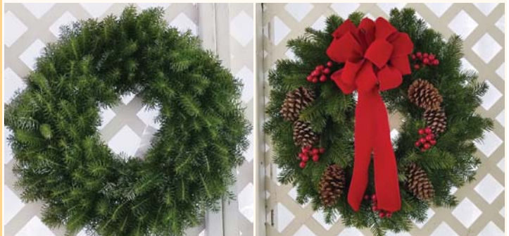
Undecorated Fraser Fir Wreath $25

Pre-Order Your Christmas Wreaths by 11/12/19 (All proceeds will be used to support field trips)